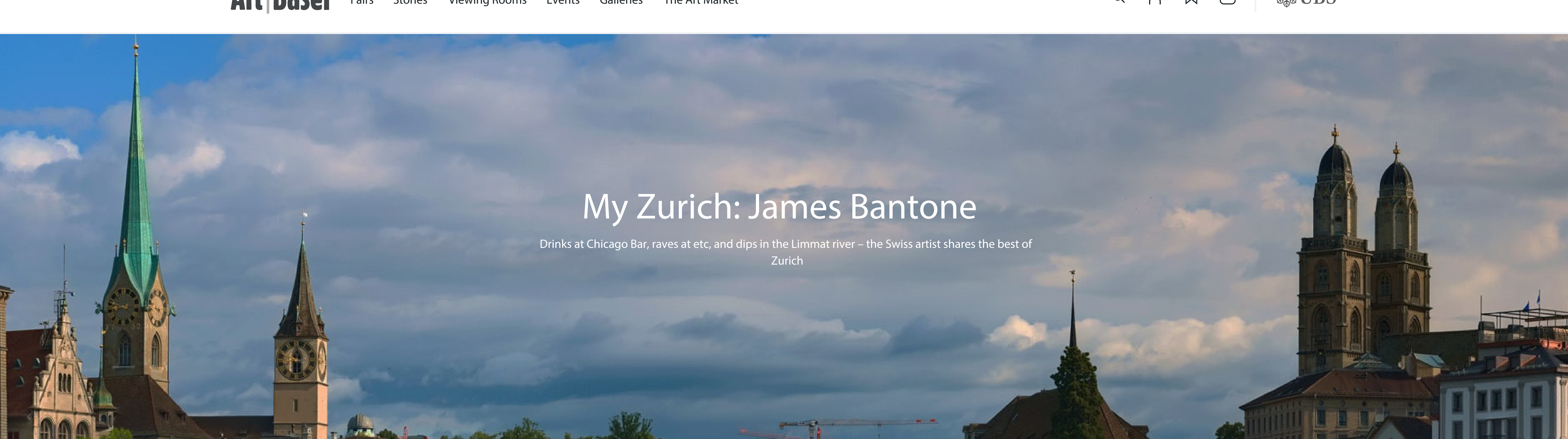
What does the word 'Zurich' mean to you? A feeling of openness, care, and understanding. Your first memory in Zurich? A kiss in the rain in the Limmat. What is the mark of a true 'Zuricher'? Freitag bags.