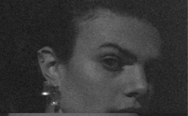
Clip earrings Lucent in three different sizes, by Swarovski

Styling Kiki Müller