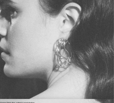
Earrings Fabric Nest, crafted in carved rhodium plated silver, by Yan Jiang Studio