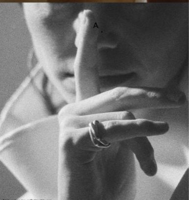
Trinity cushion ring, crafted in white, rose and yellow gold, by Cartier