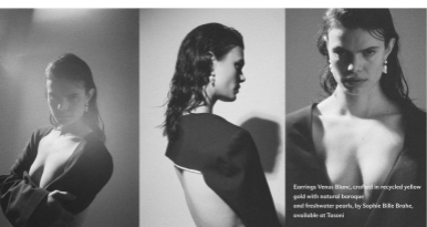
Earrings Venus Blanc, crafted in recycled yellow gold with natural baroque and freshwater pearls, by Sophie Bille Brahe, available at Tasei