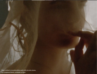
Ring crafted in recycled yellow gold with zirconia stones, by Completed Works, available at Opio