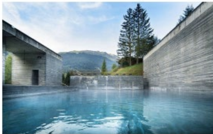
The waters are waiting ... TIGI HOTEL VALS

This story was written in collaboration with Forbes Finds. Forbes Finds covers products and experiences we think you'll love. Featured products are independently selected and linked to for your convenience. If you buy something using a link on this page, Forbes may receive a small share of that sale.