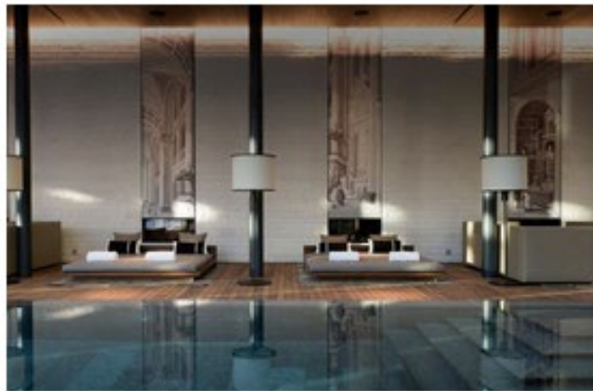
The Spa at The Chedi Andermatt | THE CHEDI ANDERMATT

Here is a place where Asian healing meet modern Swiss Chalet design in the heart of a small village surrounded by picturesque nature: The Chedi is not only an international winter hotspot for skiers, and food and wine lovers, but it also draws guests in summer to hike or simply relax. The hotel's hydrotherapy oasis consists of hot pools, saunas and steam baths, designed in the most contemporary and beautiful way—it makes you feel instantly zen as you walk in.