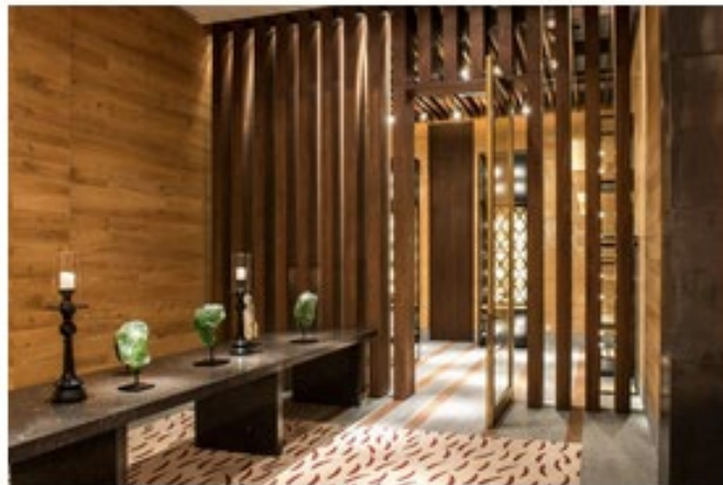
Tasoni Fashion Concept Store at The Chedi Andermatt | TASONI

Between relaxing and indulging you should not forget to stop by Tasoni, a state-of-the-art curated fashion concept store. It blends beautifully into The Chedi's contemporary design, yet stands out for its unique selection of limited editions and latest trend pieces.