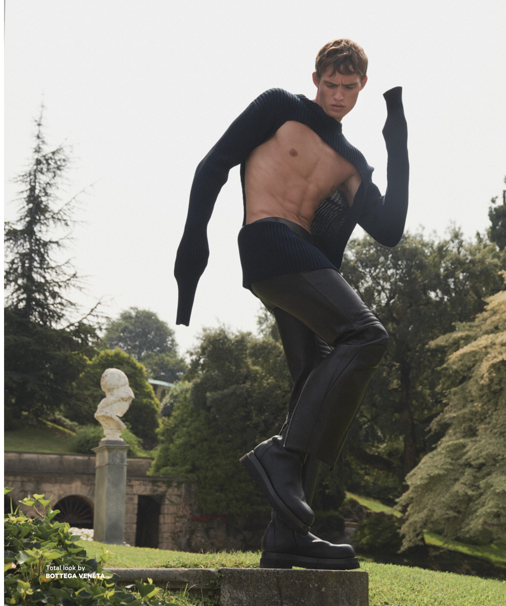
Total look by BOTTEGA VENÉTA