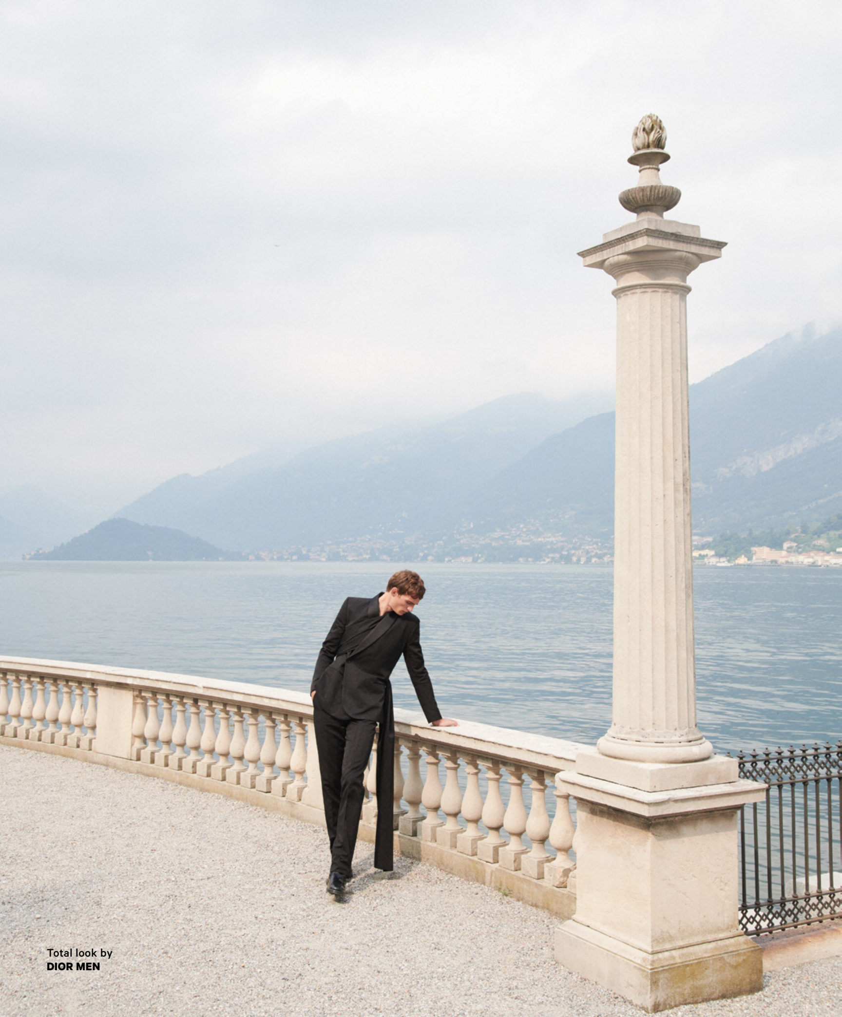
Total look by DIOR MEN