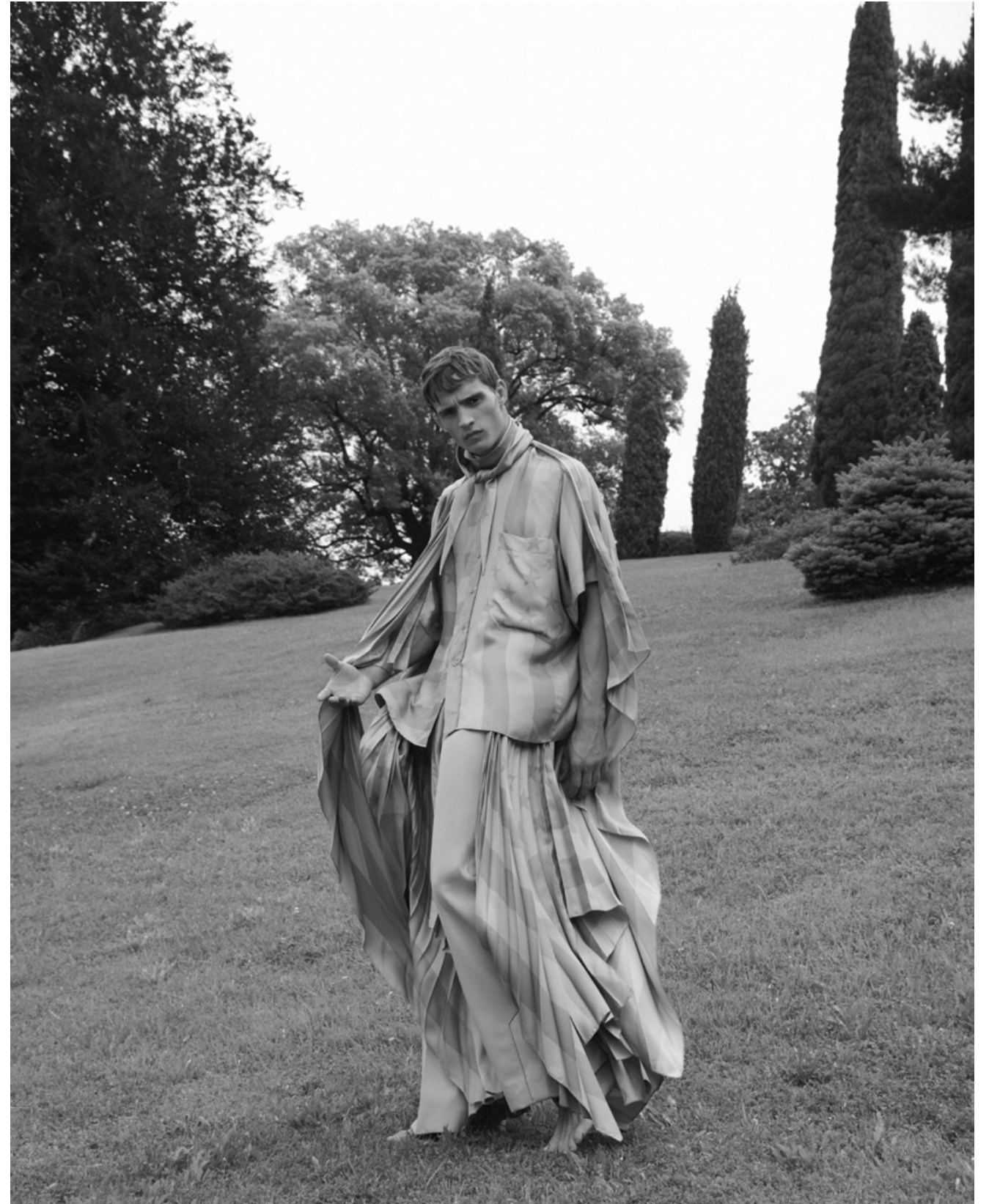
Total look by LOUIS VUITTON