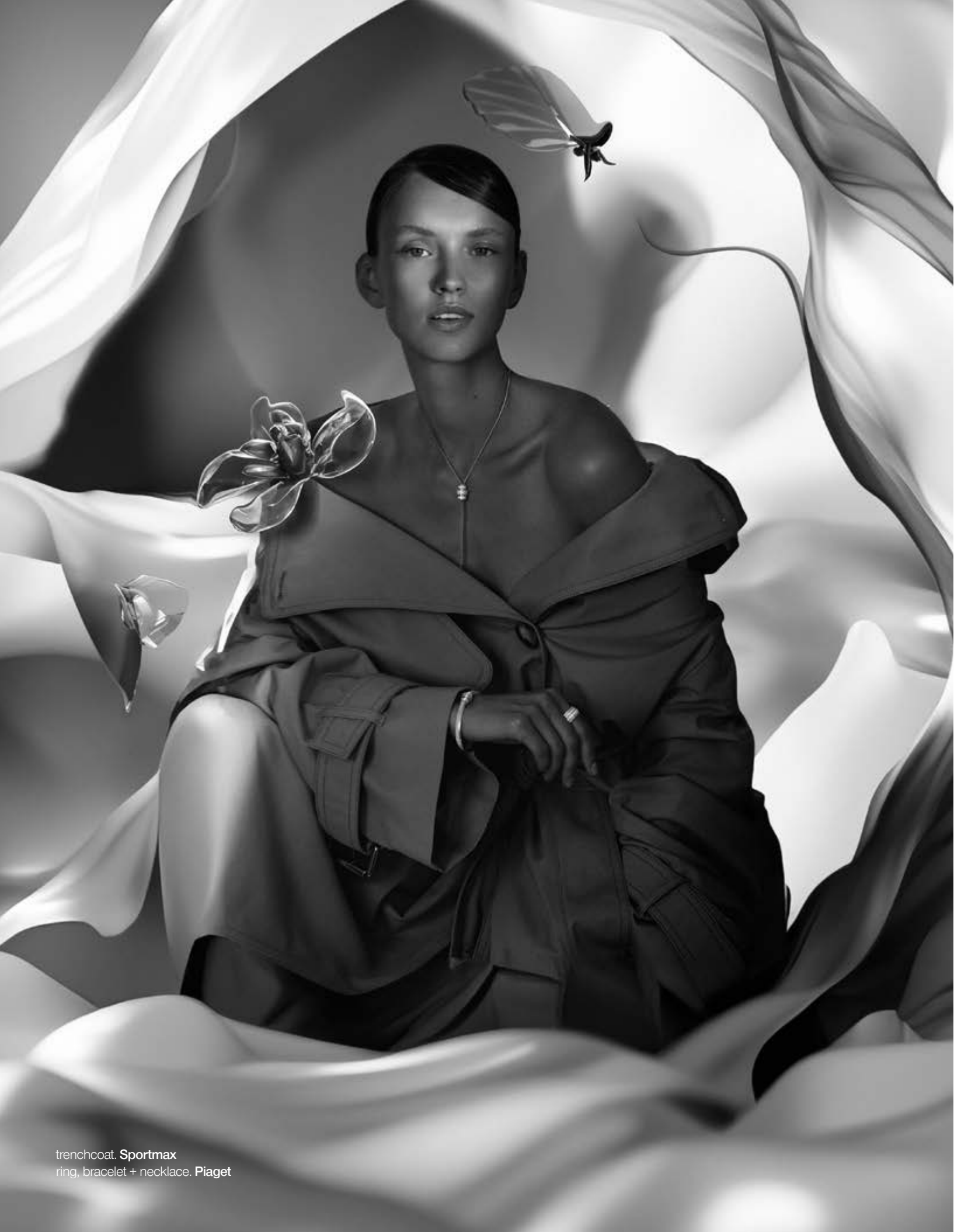
trenchcoat. Sportmax ring, bracelet + necklace. Piaget