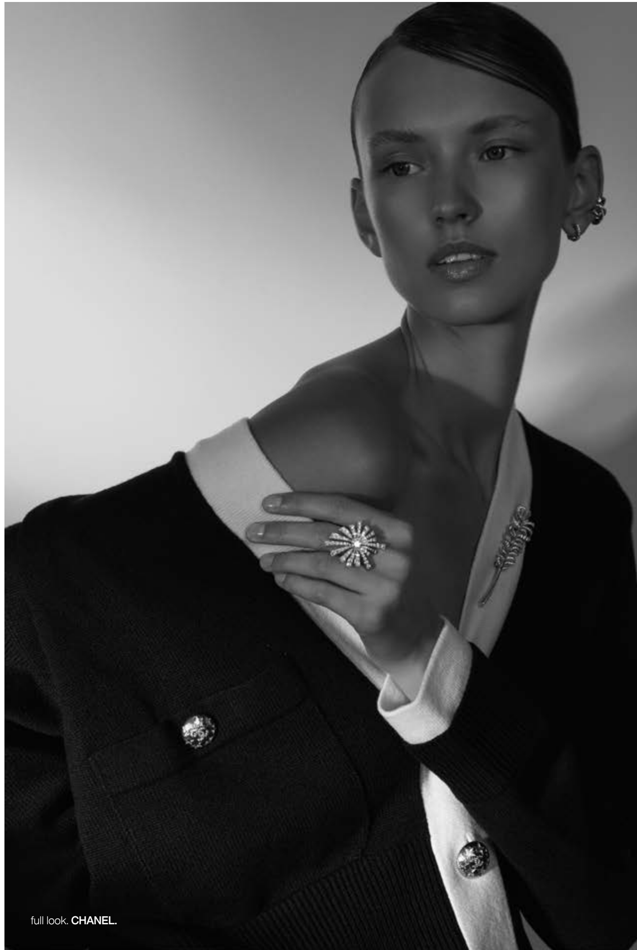
full look. CHANEL.