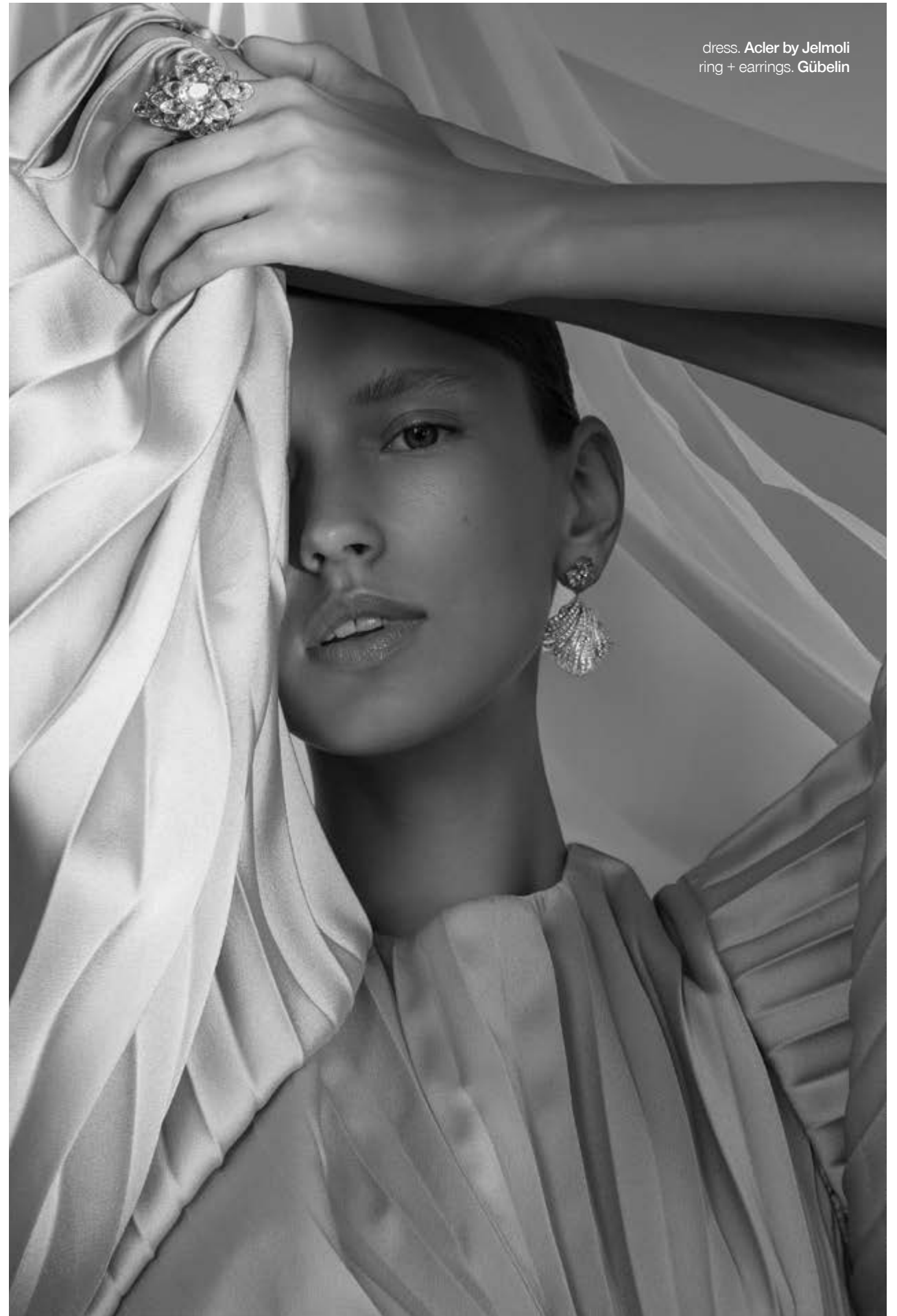
dress. Acler by Jelmoli ring + earrings. Gübelin