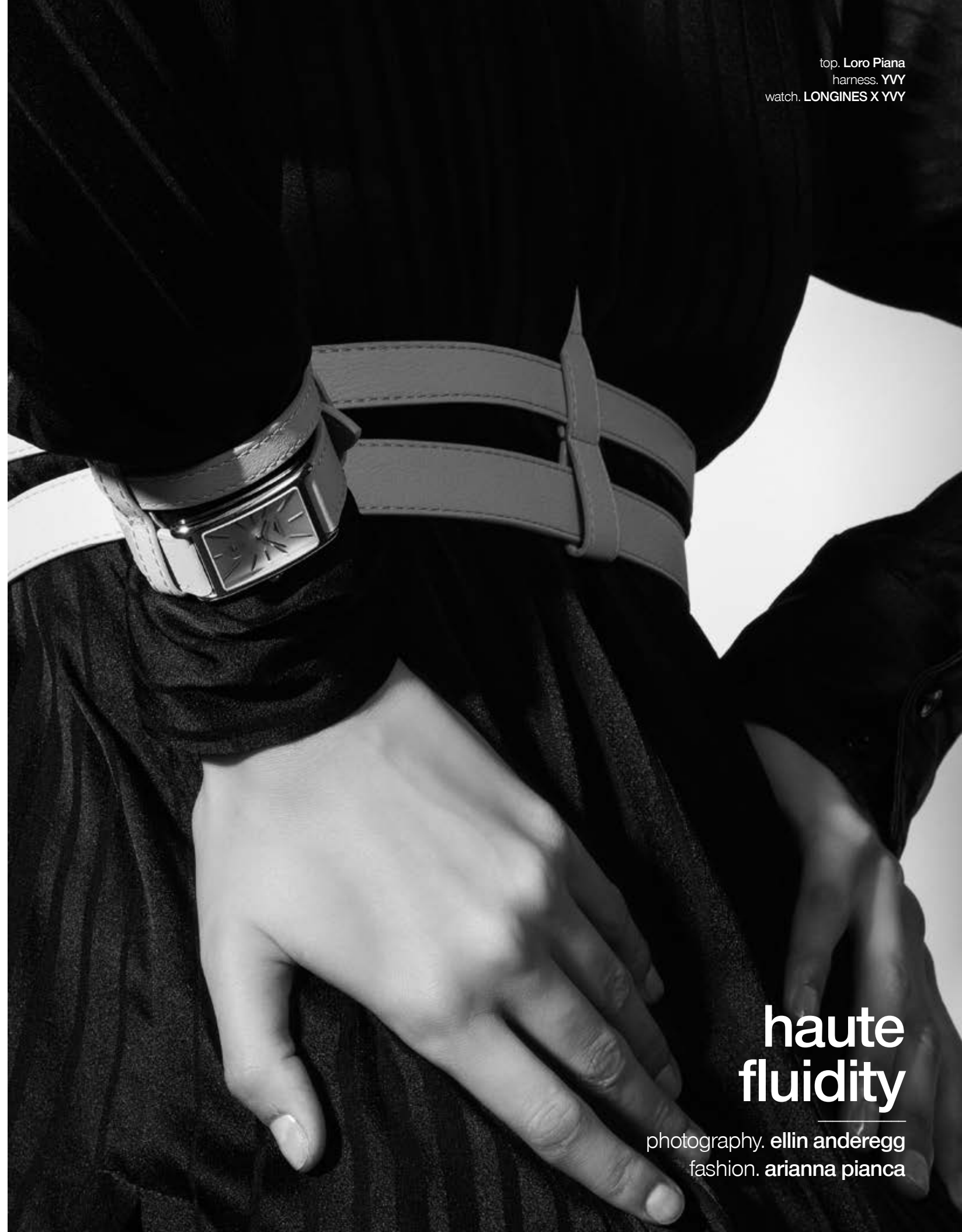
top. Loro Piana harness. VVY watch. LONGINES X VVY