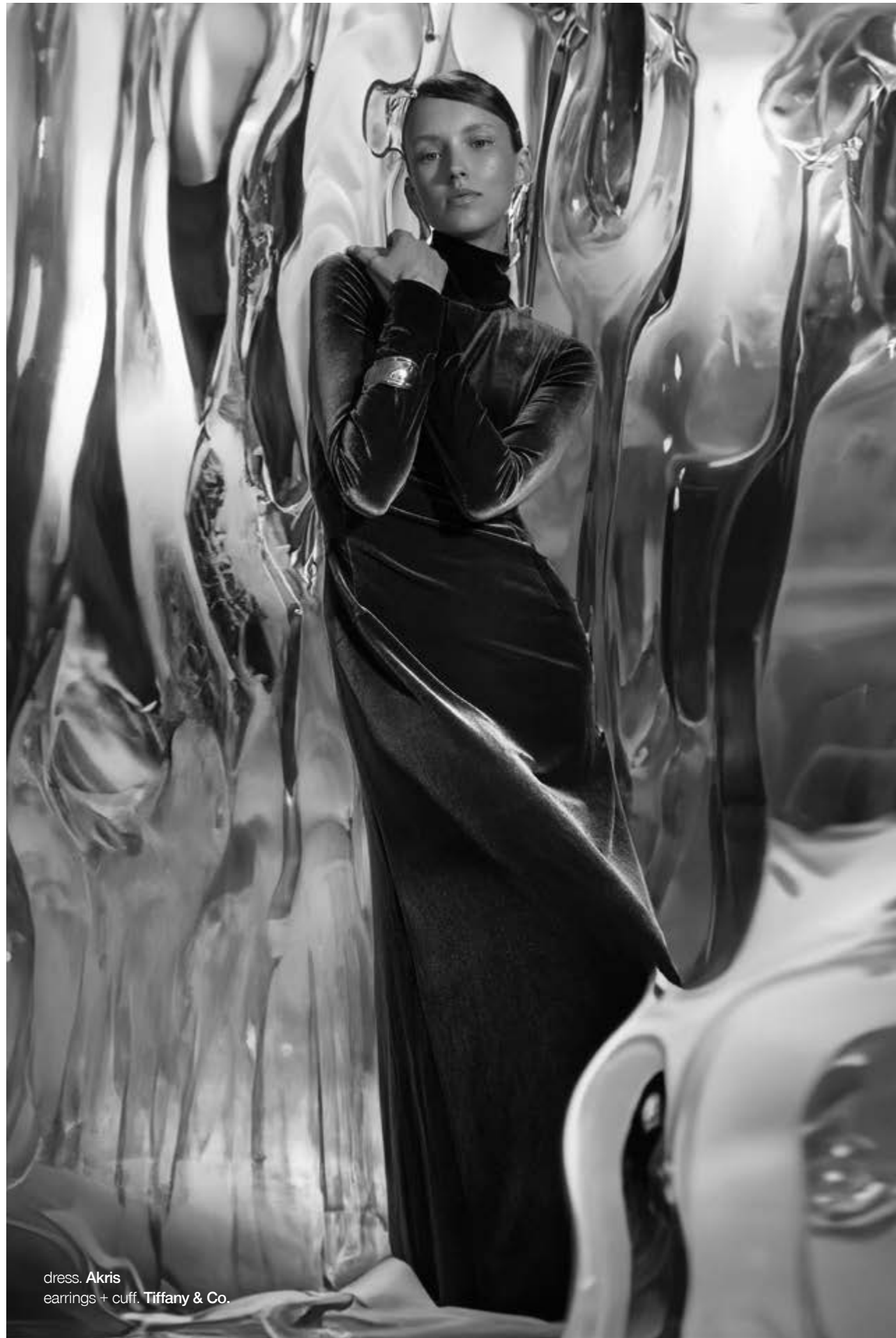
dress. Akris earrings + cuff. Tiffany & Co.